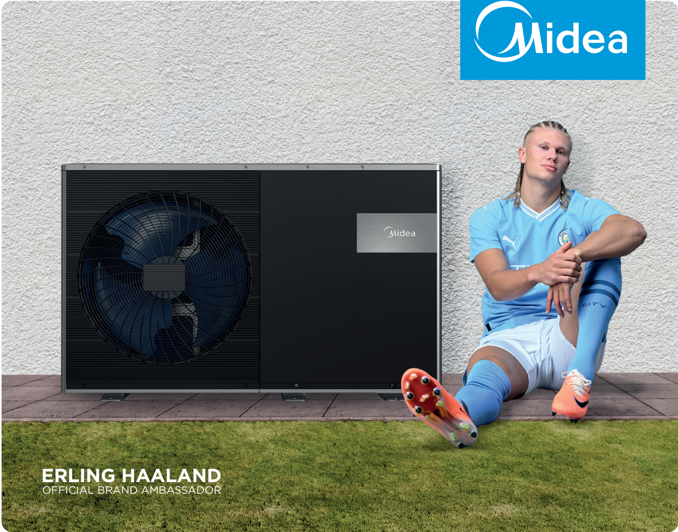
ERLING HAALAND OFFICIAL BRAND AMBASSADOR